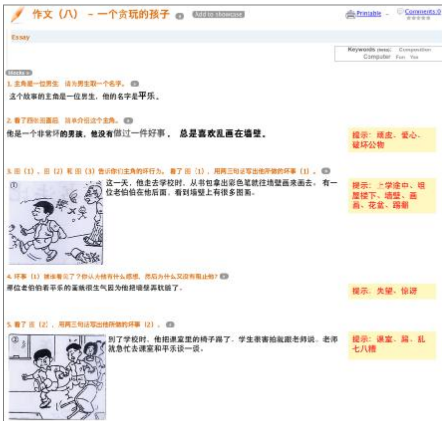
Figure 2. A scaffold with question prompts and helping words (text on the right).